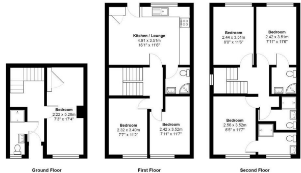
Total Area: 111.3 m 2 - 1198 ft 2 All measurements are approximate and for display purposes only